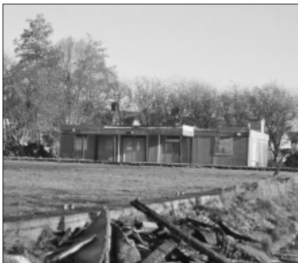
A sorry sight after years of active use. The bowling club pavillion will be demolished soon.

In November 2006 Friends were advised that an external funding bid would be made by Parks Dept in April 2007 and it has proved rather difficult to get a very clear view of what is happening but we have been assured that the Friends will be involved in any future consultation. Hopefully Parks Dept officials will be present at our AGM on 15 April to update us all on the present position. FODP research has consistently shown that park users desire a café, toilets and permanent staff in the park. Local schools and organizations have expressed interest in utilising any new facility in the park.