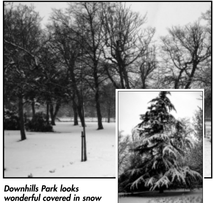
Downhills Park looks wonderful covered in snow