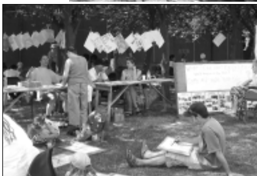
Left: Friends canvas opinions from local people at their Art in the Park stall