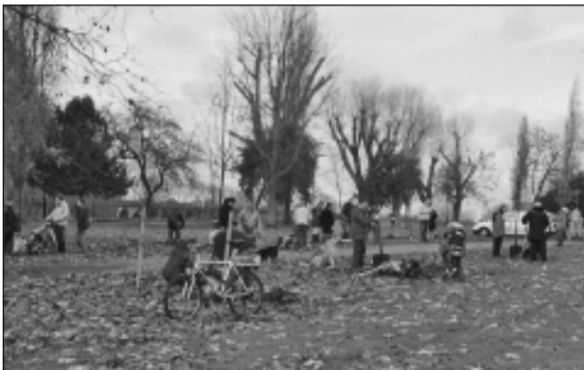
Lots of enthusiastic friends of the park help to recreate the lime tree avenue with new tree planting

On the credit side we have run the annual Art in the Park event and in 2003, celebrated the centenary of Downhills with a festival and video. Each year we have liaised with BTCV for community tree and bulb planting. This has enabled the Lime tree avenue from Philip Lane gate to be nearly replanted. We hope to complete this task in winter 2007. Flowering cherries have been planted to revive the area south of the Italian gardens and spring flowering bulbs to turn the Wood into a mass of yellow daffodils and later bluebells. Numerous other trees have been planted in the park. The tennis courts, once on the brink of demolition, are now well maintained and well used.