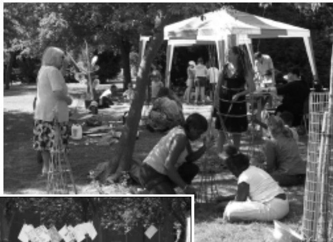
Children hard at work willow-weaving at Art in the Park.

▶ Next Art in the Park Sunday 15th July 1pm-6pm