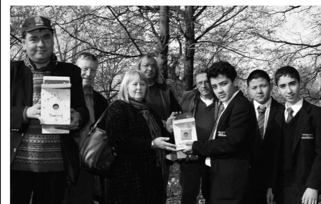
Park View Academy students handing over bird and bat boxes they had made to the Friends of Downhills Park and parks staff.

Friday 30 April (8pm +), hear and see real bats with BTCV and the Bats Conservation Trust, meet: Philip Lane gate, Downhills Park - 8pm OPEN TO ALL NITE OWLS!